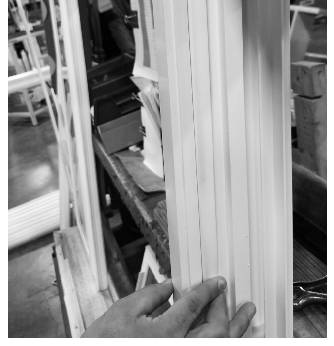
STEP FOUR: To replace balance covers position covers over jambs with interior edge of covers in balance cavity. Relocate by folding lower exterior corners into place and sliding finger up joint.