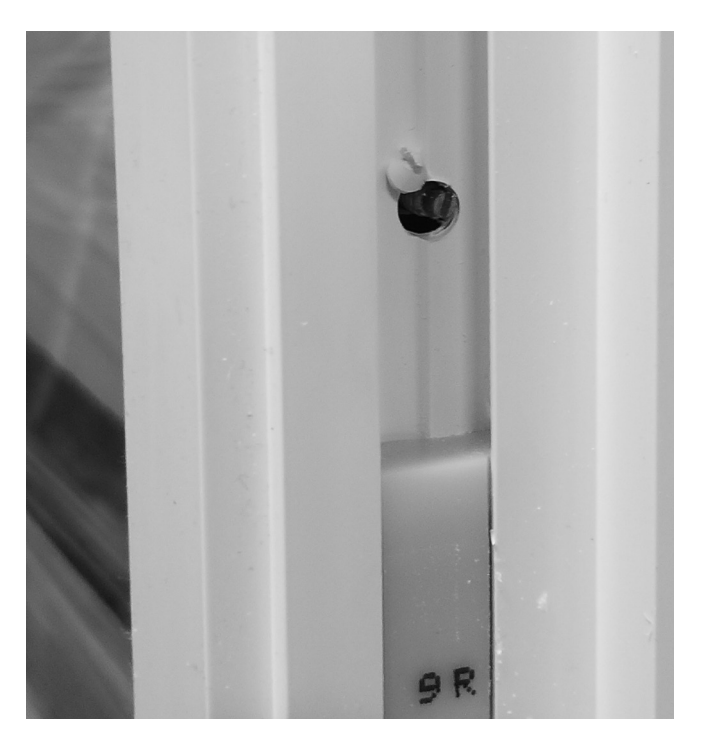
STEP THREE: Once all installation screws are driven, tighten wafer head jamb adjuster to bring jamb parallel with glass inserts. Repeat procedure on other jamb. Adjust as necessary.